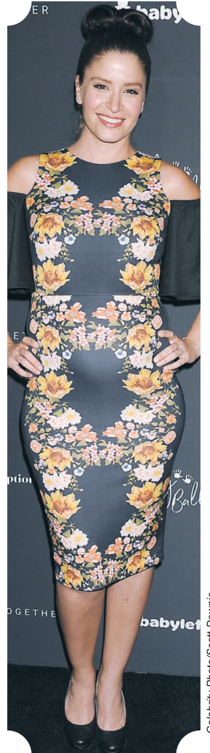
Mercedes Mason during the 7th Annual Baby Ball Gala at Neuhouse Hollywood. The event supports recycled baby items for families in need.